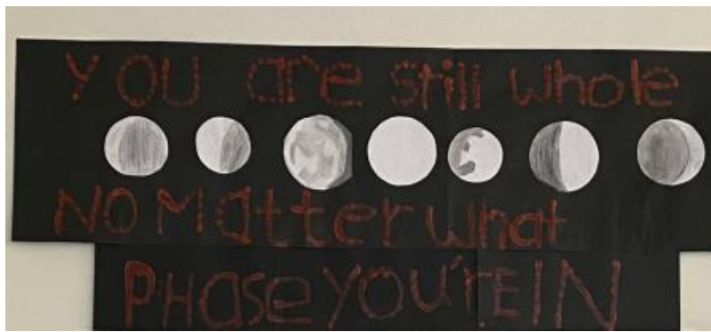
2 Federer also completed a class poster on the phases of the moon.